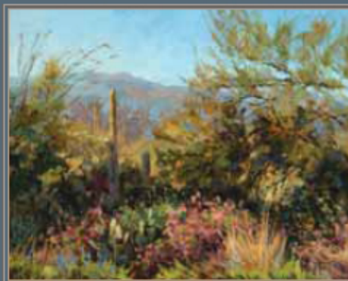
"Patchwork of Fairyduster" 11 x 14 oil